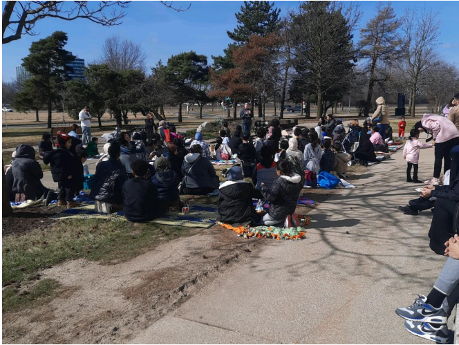
Geer Park School visit to Henry Ford Centennial Library.

Presented at the Library Commission Meeting